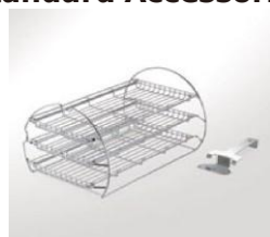
Tray Set (Wire Tray) All models with 1 set