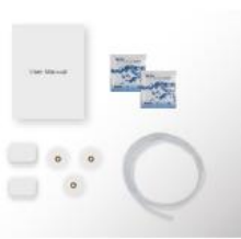
Starter kit All models with • User Manual x 1 pc., • Printer Paper x 5 pcs., • Cham-mate x 2 pcs., • Silicone Tube x 2 pcs.