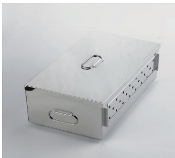
Sterilization Box All models with 1 set.