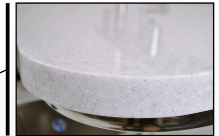
Artificial Marble Countertop