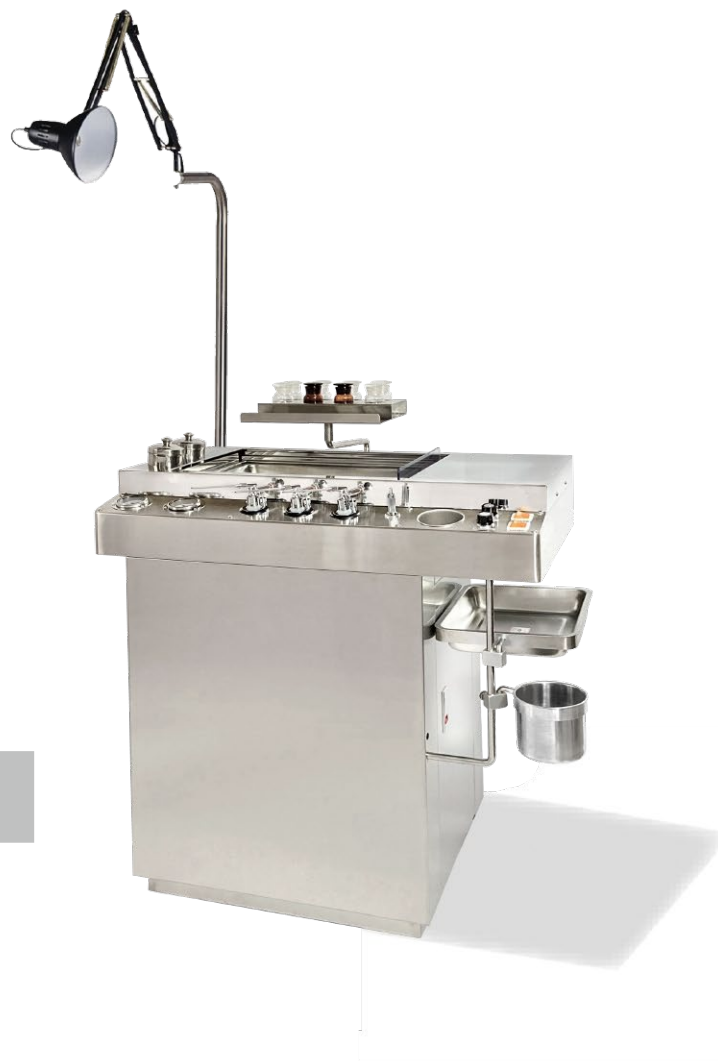
SN-805 For small areas 3 spray guns