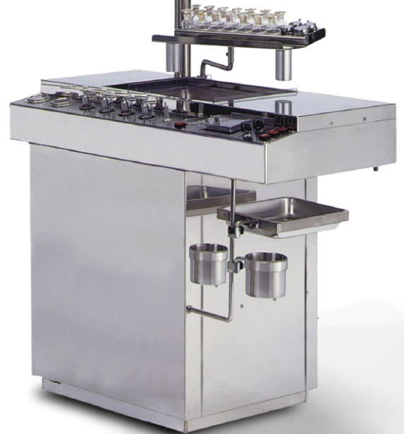
SN-801 - 4 spray guns