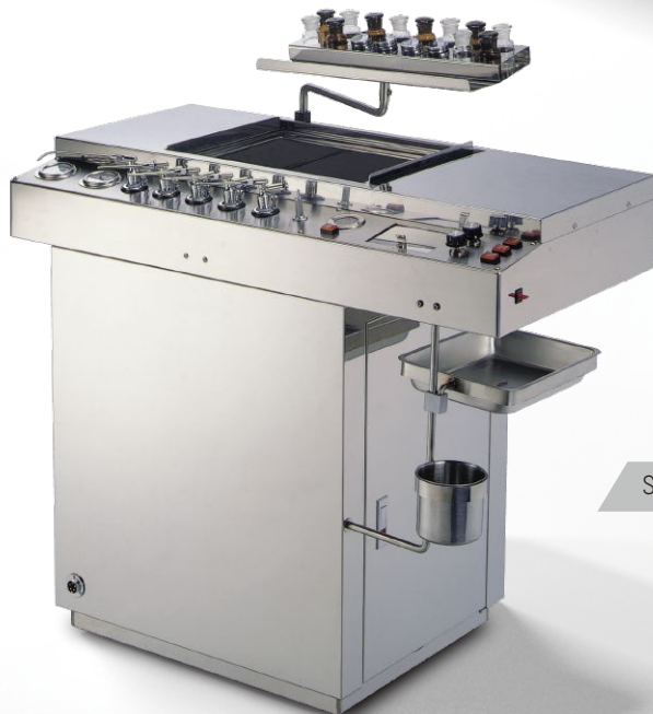
SN-802 - 5 spray guns