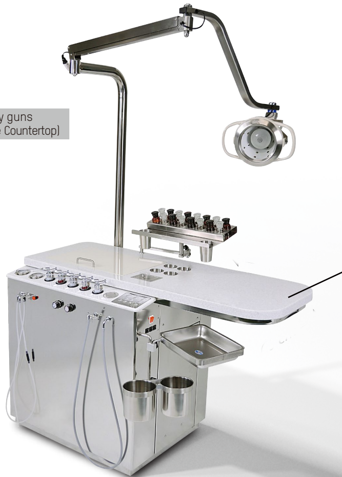
SN-803 - 5 spray guns (Artificial Marble Countertop)