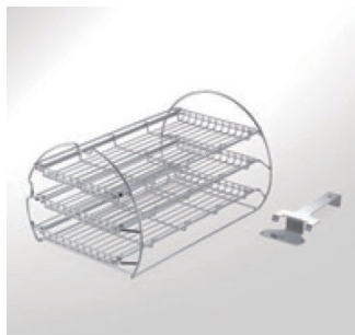
Tray Set (standard)