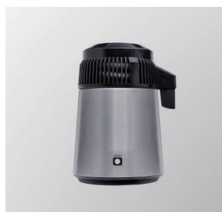
Water Distiller (optional)