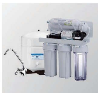
RO Water Filter (optional)