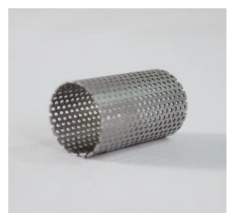
Exhaust Filter (standard)