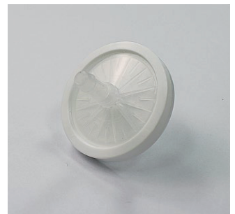
Air Filter (optional)